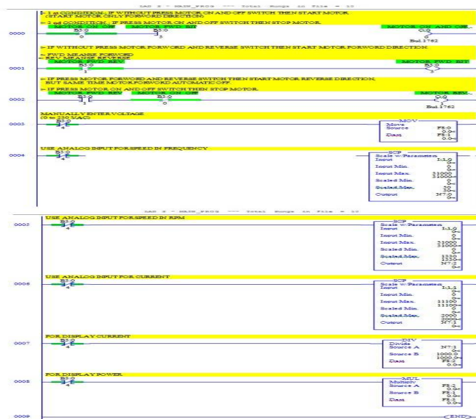
Figure 4.1: Ladder Diagram

Under the IEC 61131-3 standard, PLCs can be programmed using standards-based programming languages. A graphical programming notation called Sequential Function Charts is available on certain programmable controllers. Initially most PLCs utilized Ladder Logic Diagram Programming, a model which emulated electromechanical control panel devices (such as the contact and coils of relays) which PLCs replaced. This model remains common today. The developed ladder logic is shown in figure 4.1. Power flows through these contacts when they are closed. The normally open (NO) is true when the input or output status bit controlling the contact is 1. The normally closed (NC) is true when the input or output status bit controlling the contact is 0.